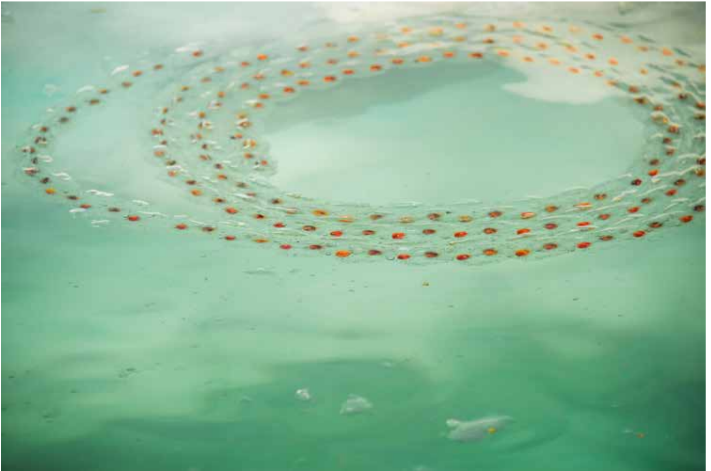
Salp Archival print Edition of 10