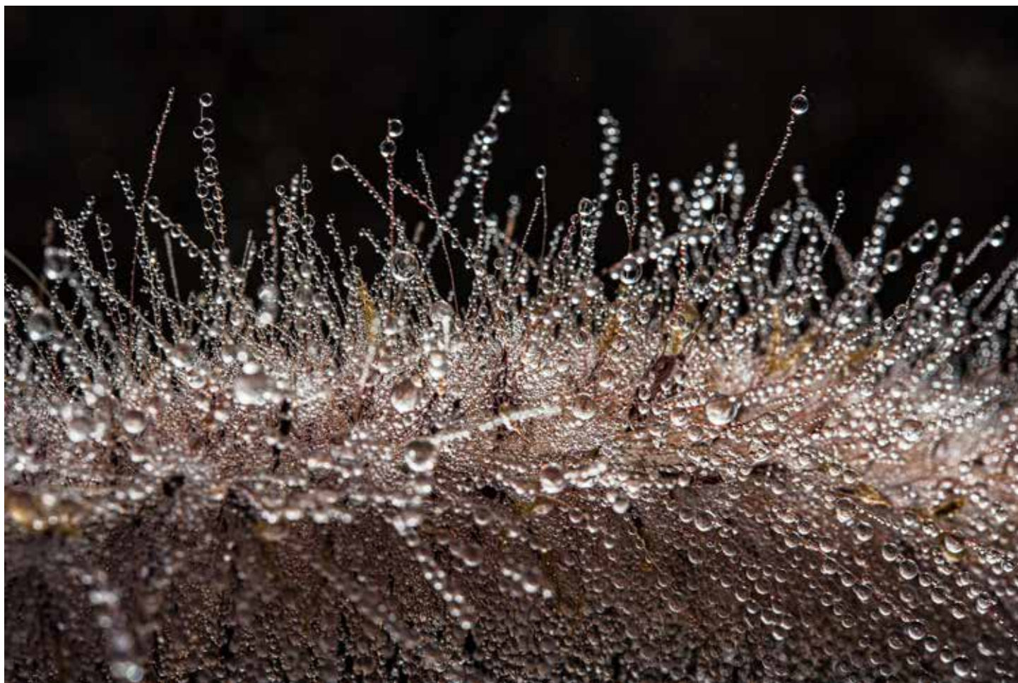
Sparks Archival print Edition of 10