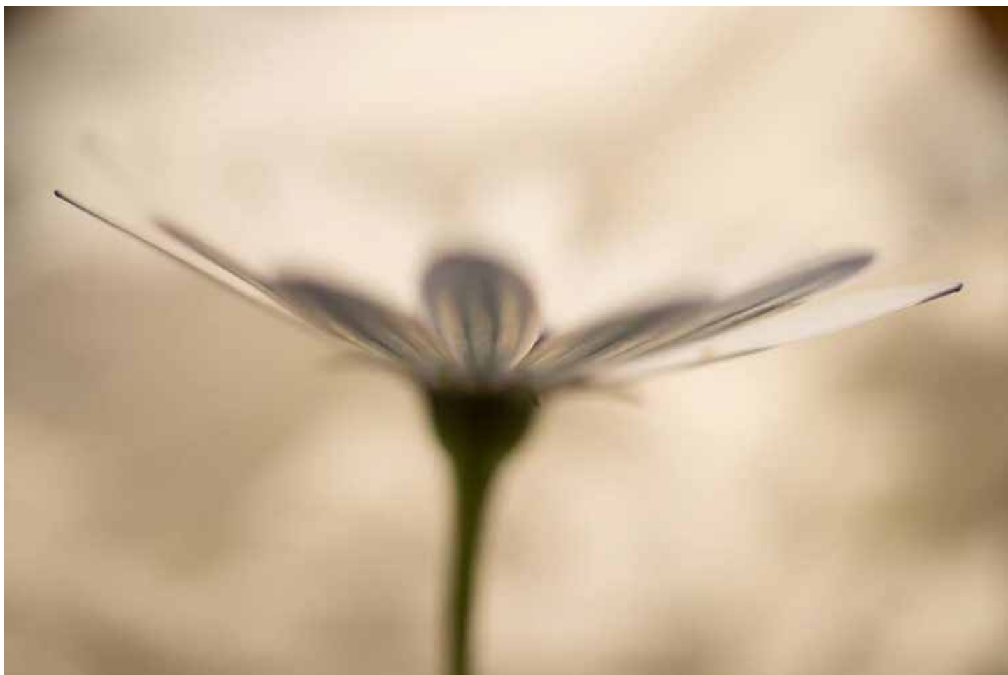
Daisy Archival print Edition of 10