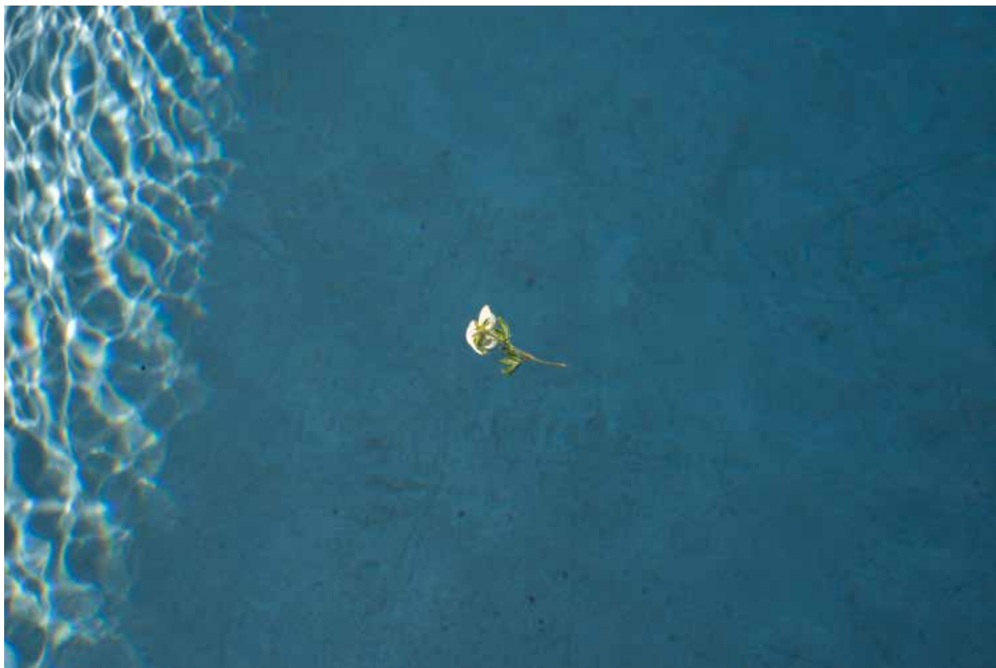
Floating Archival print Edition of 10