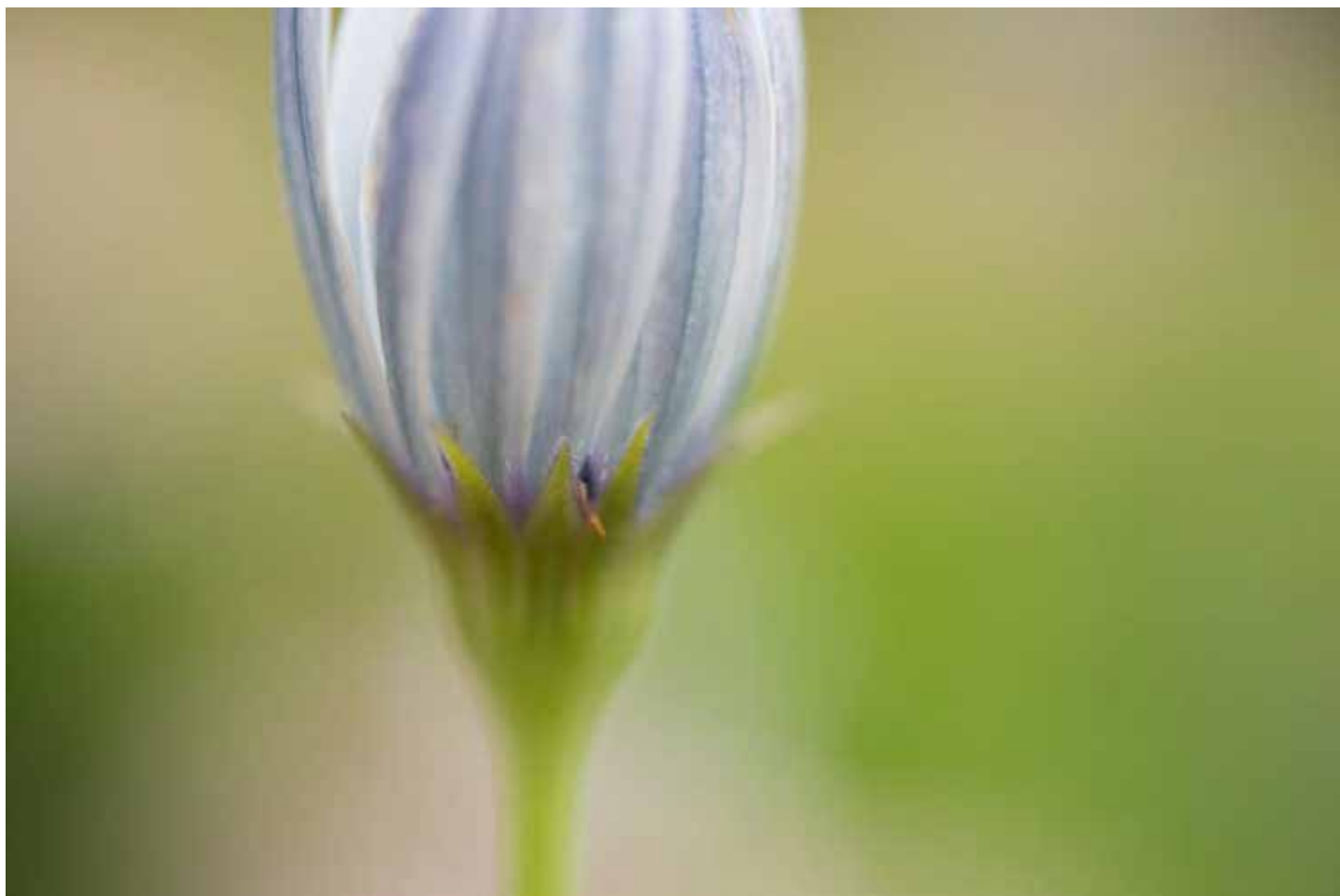
Flower Archival print Edition of 10