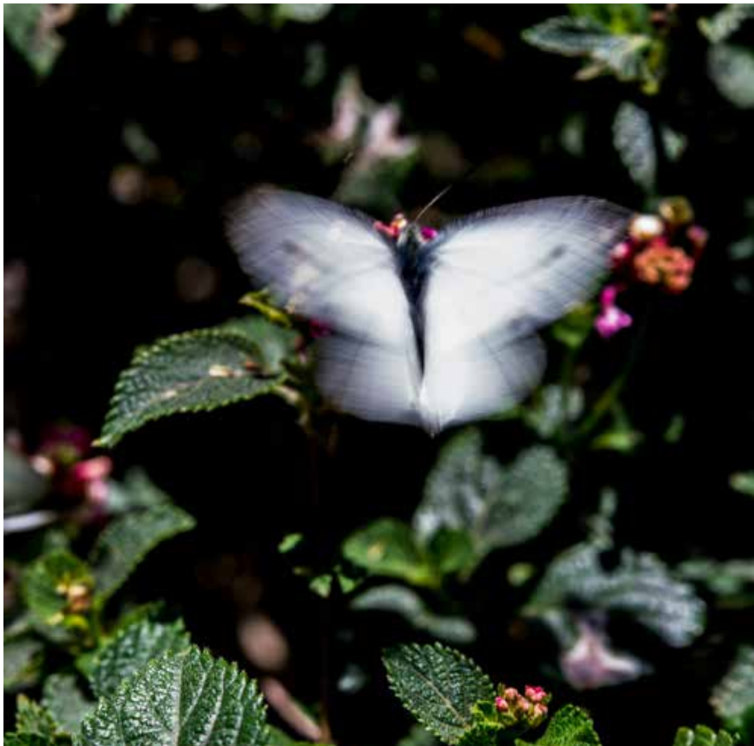
Butterfly Archival print Edition of 10