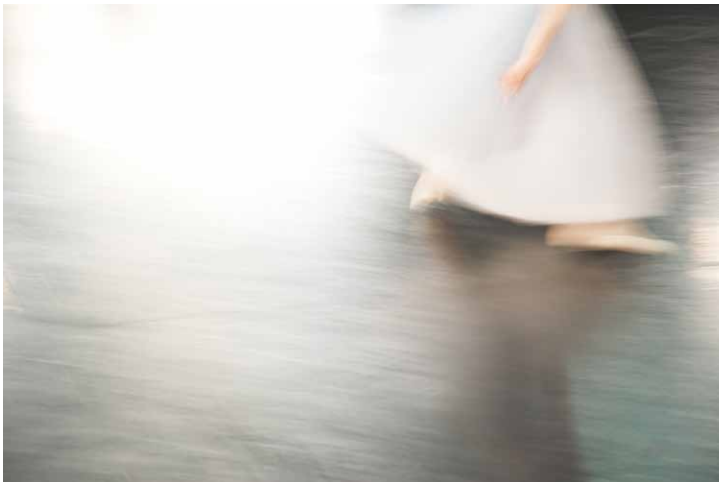
Running Away Archival print Edition of 10