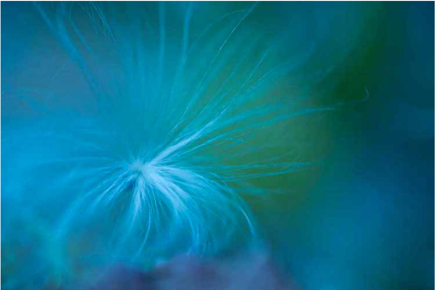
White Strings Archival print Edition of 10