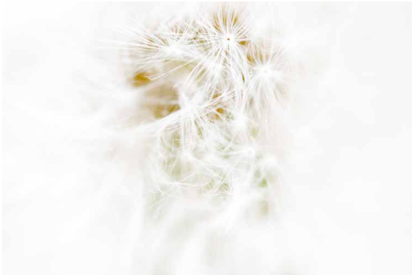
White Hair Archival print Edition of 10