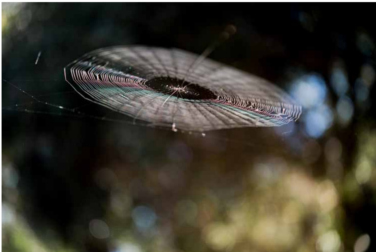
Space Ship Archival print Edition of 10