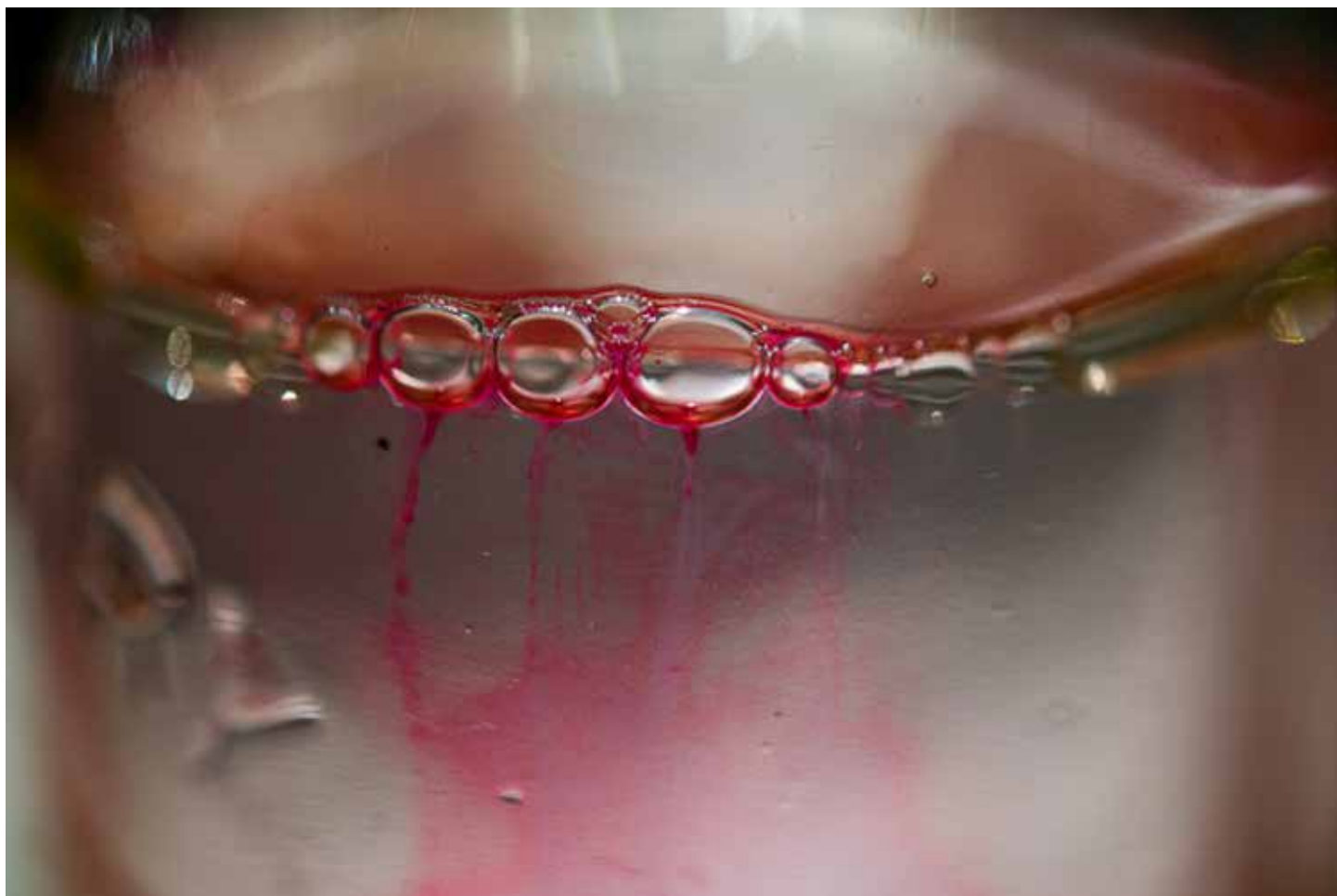
Water Thread Archival print Edition of 10