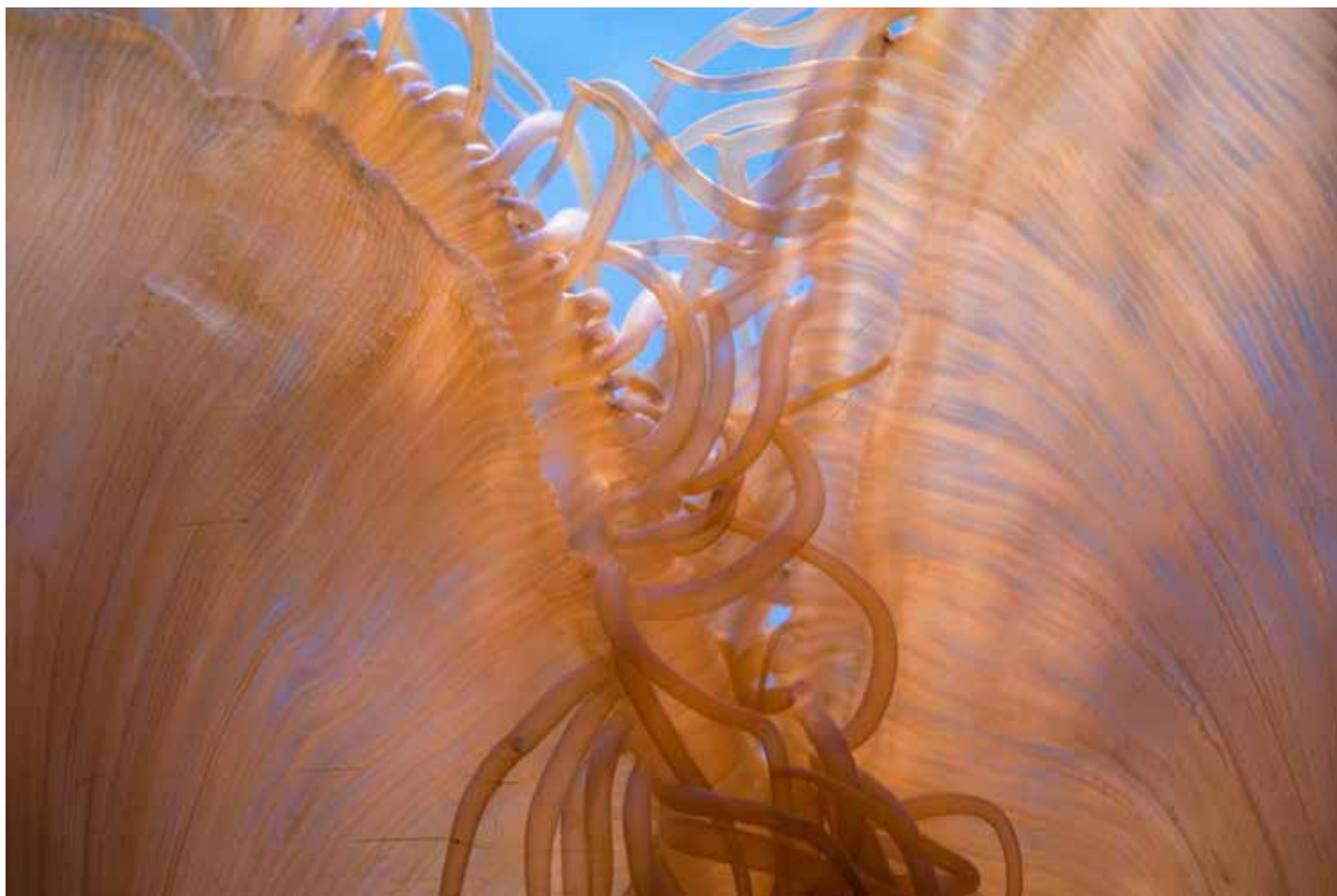
Tubes Archival print Edition of 10