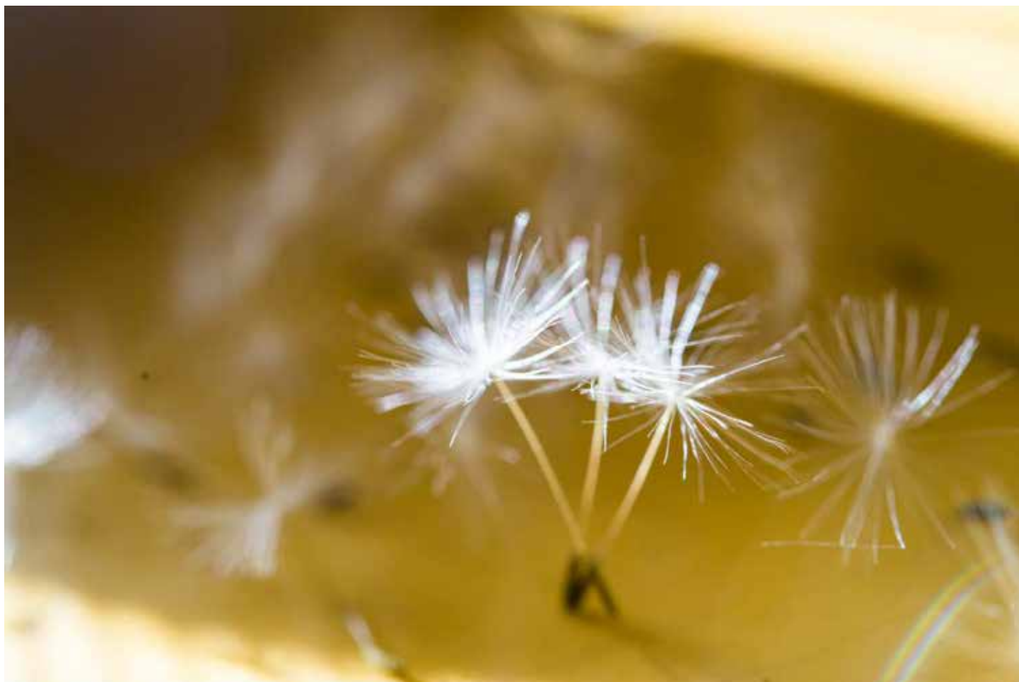
Dancers Archival print Edition of 10