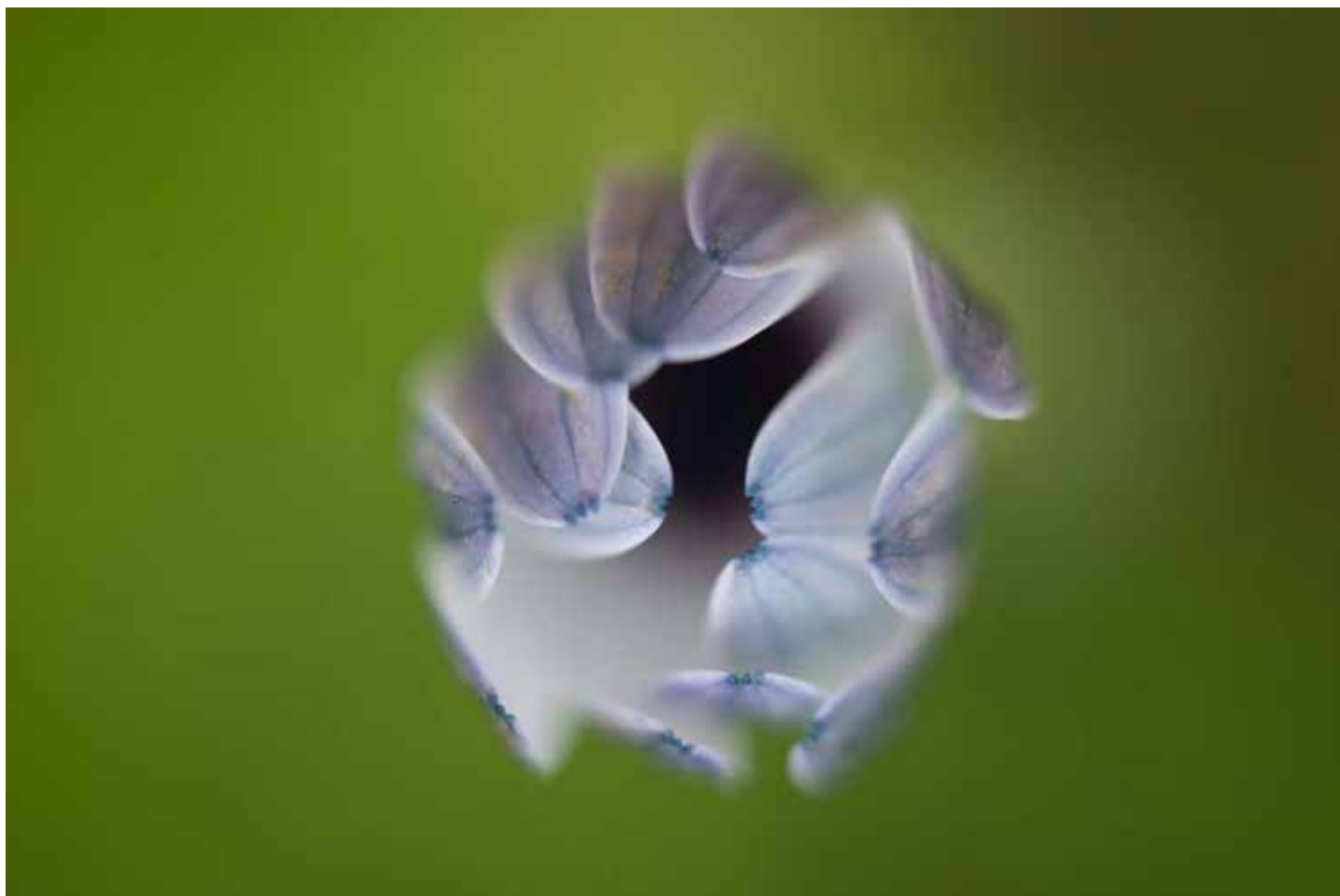
Closing Archival print Edition of 10