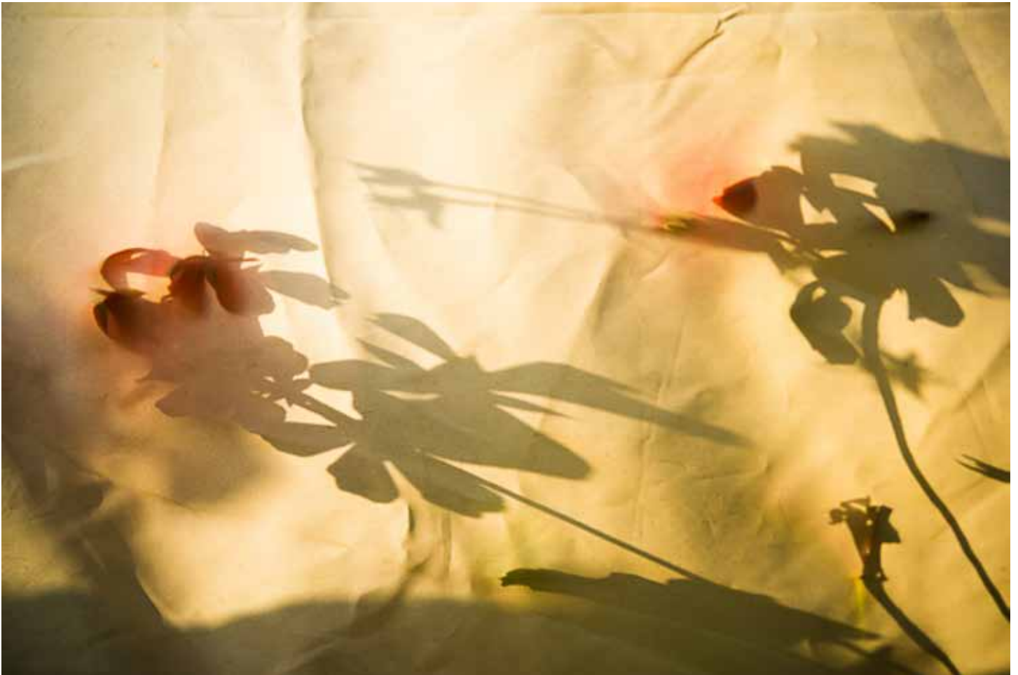
Color Shadows Archival print Edition of 10