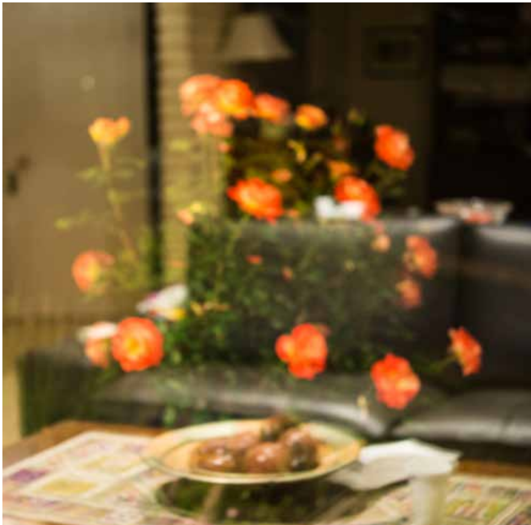
Blast Archival print Edition of 10